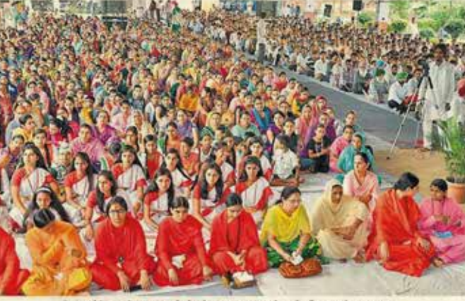
दिव्य ज्योति जागृति संस्थान की ओर से करवाए गए कार्यक्रम के दौरान उपस्थित श्राहातु।

वाले लोगों में ऐसी भावना है। के प्रशंसा की।